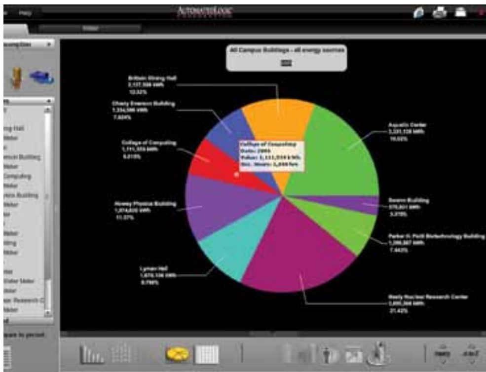
Reports can be generated in colorful pie charts...

Accessed through a standard browser, EnergyReports offers a variety of colorful graphical formats as well as spreadsheet-style data. Reports include occupied/unoccupied usage, Cooling Degree Days (CDD), Heating Degree Days (HDD), low-median-high data and benchmark comparison data. Users can normalize consumption information or